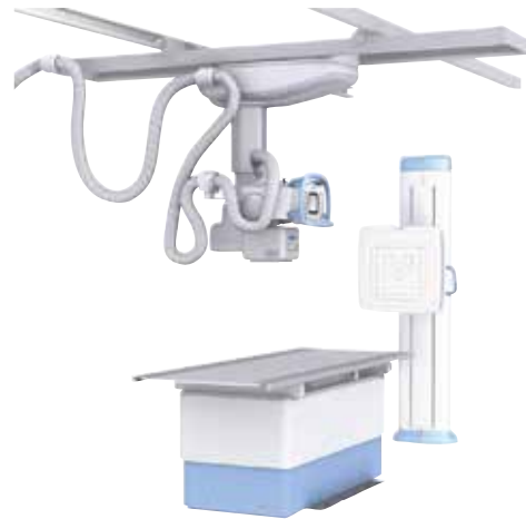
XTREME General X-Ray Rooms