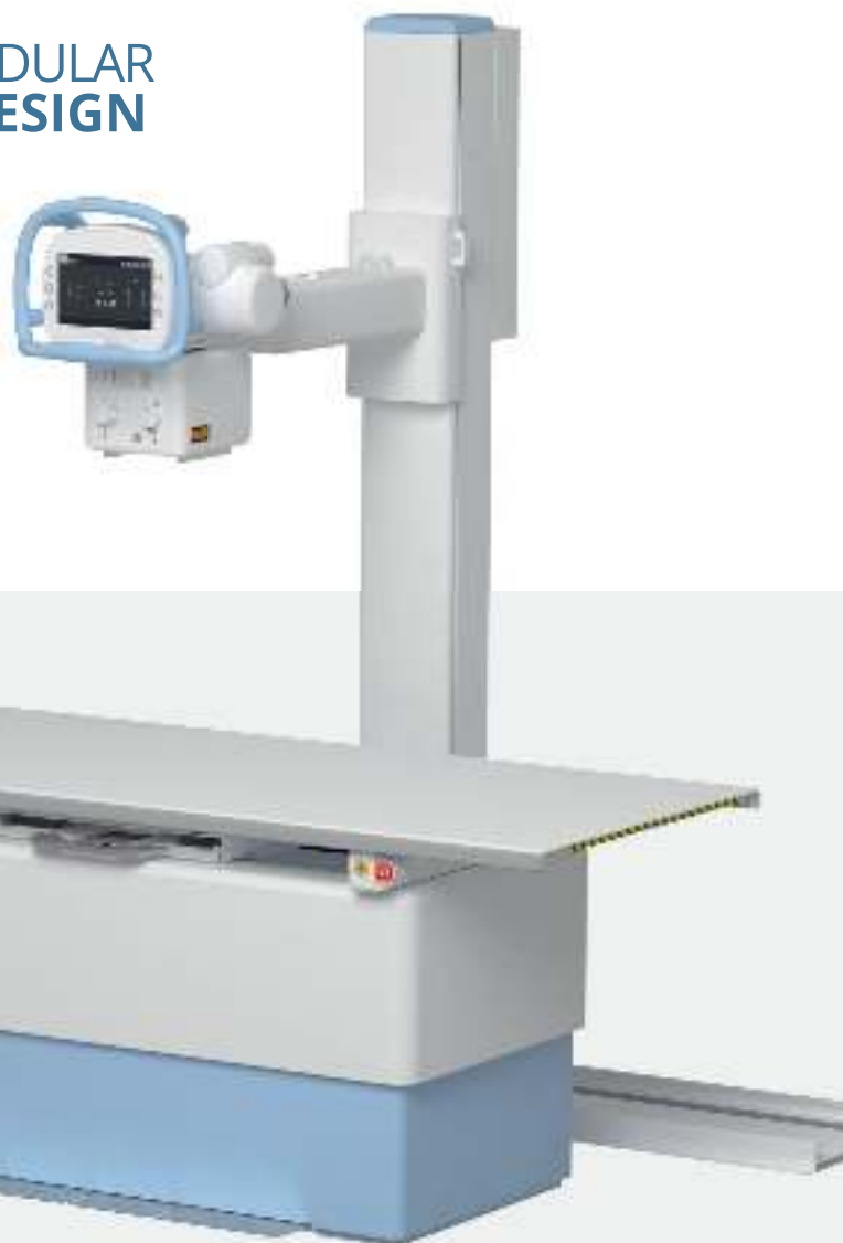
10.3" TDDI Touch Console AEC, APR, positioner status and control display.